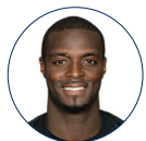
Plaxico Burress NFL