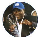
O.J. Anderson NFL