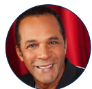
Clifton Davis Grammy Winner